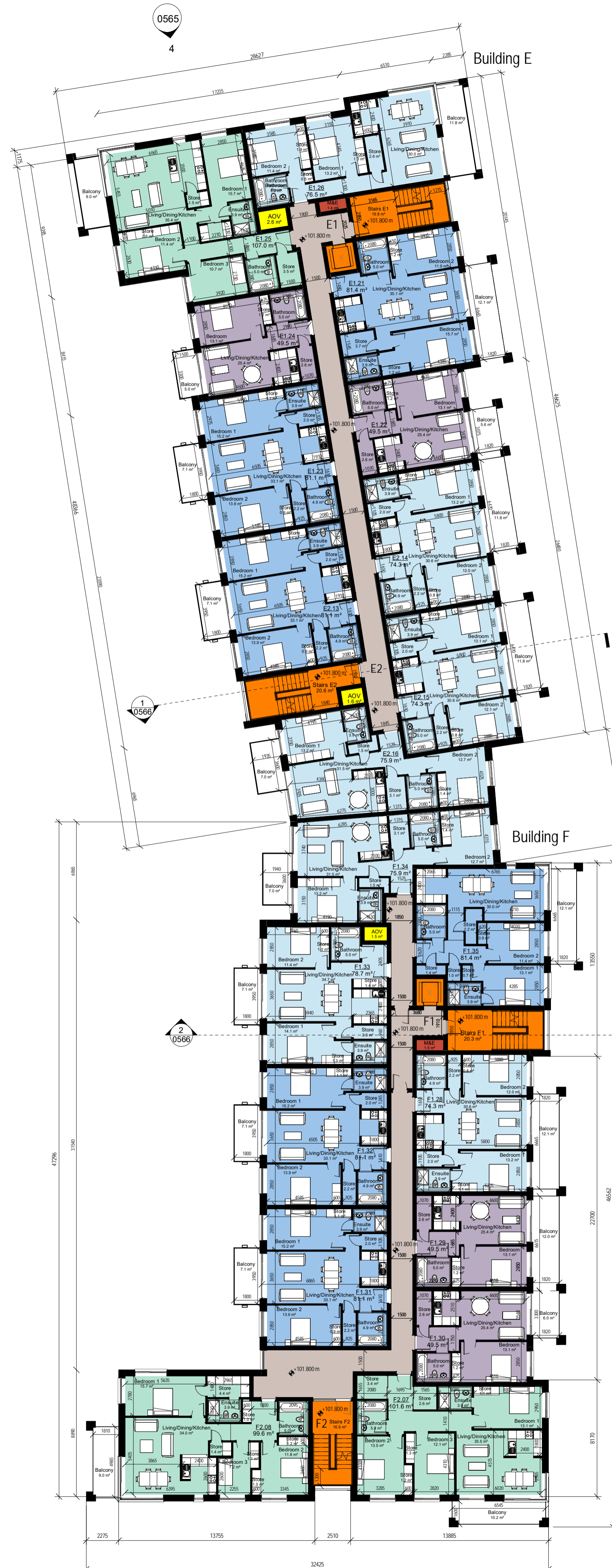
Proposed Fourth Floor Plan 1:200